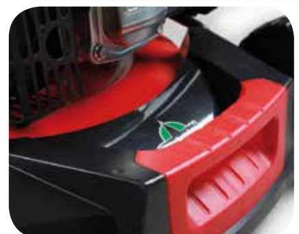
Front Lift Handle