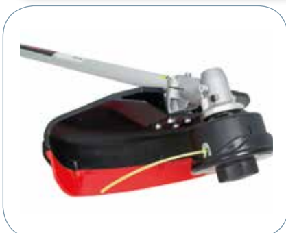
Tap & Go Nylon Cutting Head