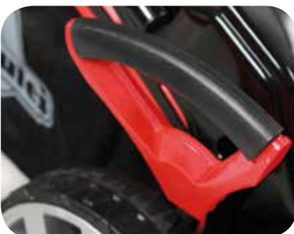
Easy Grab Height Adjuster