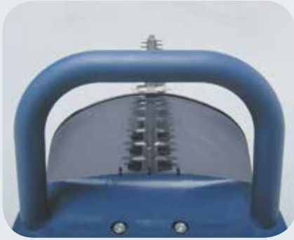
Front Handle with Debris Guard *Model F Series E8FV 750 PRO