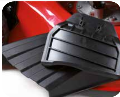
Side Discharge Chute