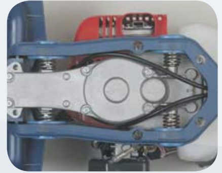
Bottom Gear Casing with Anti-Vibration Springs