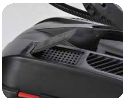
Bag full Indicator