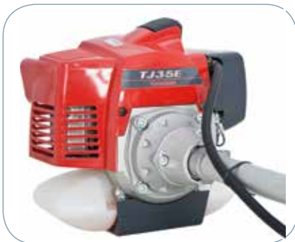
Powerful Kawasaki Engine

The following accessories are included with all brush cutters: • Shoulder harness • Protective Goggles • 3 or 4 Tooth Blade.