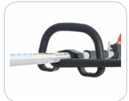
Loop Handle with barrier