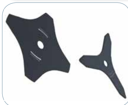
BC 340 4/ BC 340D - 4 Tooth Blade BC 550 3 Tooth Blade